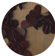
Brass Fitting with Claret Barnacles