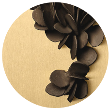
Brass Fitting with Mid Bronze Barnacles

As each 'barnacle' form is hand-crafted by Davies using reclaimed materials, colours may vary subtly from website images. You will also see the artist's touch in each piece – a mark of artisanal quality and the evolving dialogue between creator and creation. Similarly, metal finishes, particularly hand-rubbed bronze, may vary in tone from mid to dark bronze.