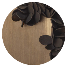
Brass Fitting with Dark Bronze Barnacles