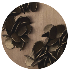
Brass Fitting with Mid Bronze Barnacles