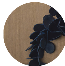
Brass Fitting with Ink Barnacles