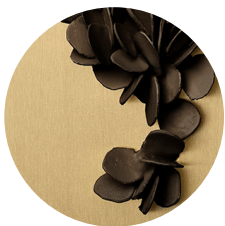
Brass Fitting with Mid Bronze Barnacles

As each 'barnacle' form is hand-crafted by Davies using reclaimed materials, colours may vary subtly from website images. You will also see the artist's touch in each piece – a mark of artisanal quality and the evolving dialogue between creator and creation. Similarly, metal finishes, particularly hand-rubbed bronze, may vary in tone from mid to dark bronze.