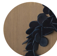
Bronze Fitting with Ink Barnacles