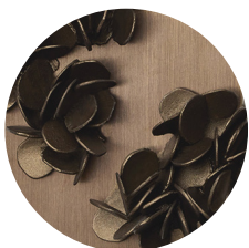
Bronze Fitting with Mid Bronze Barnacles