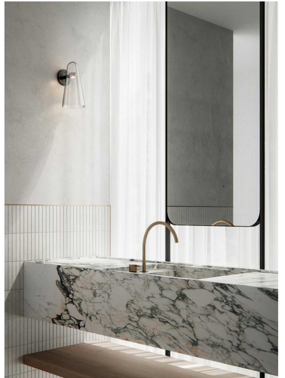
Above: Domi Wall Sconce; Opposite: Float Hover Tall Wall Sconce