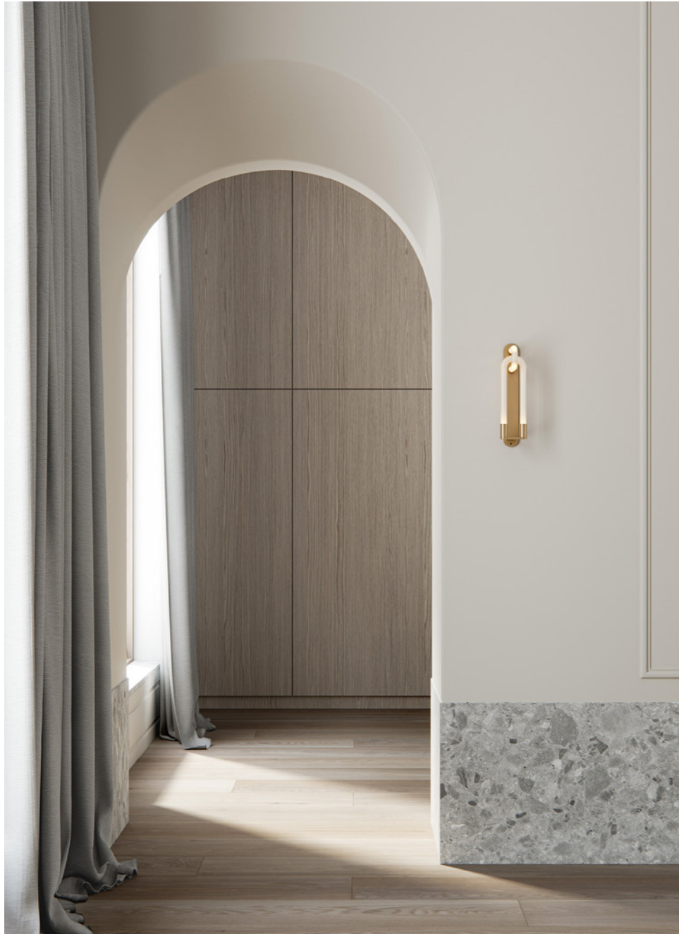
Above: Loopi Single Wall Sconce; Opposite: Scandal Short Wall Sconce