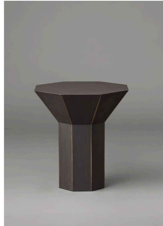
VENEER Dark Wenge BRONZE FINS