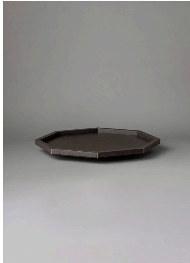
VENEER Dark Wenge BRONZE FINS