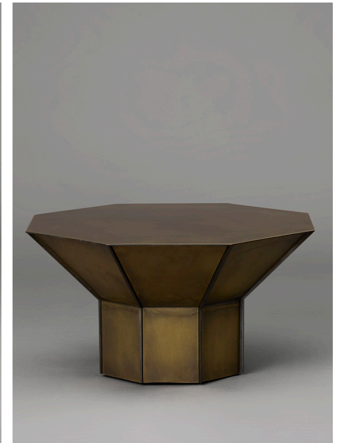
BURNISHED BRASS BRONZE FINIS