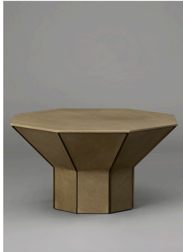
SHORT SIDE TABLE