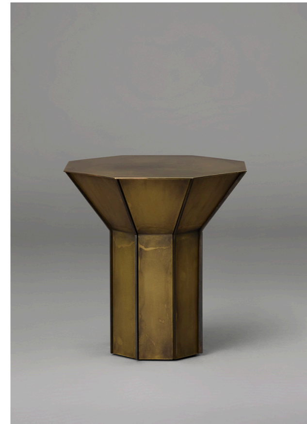
BURNISHED BRASS BRONZE FINIS