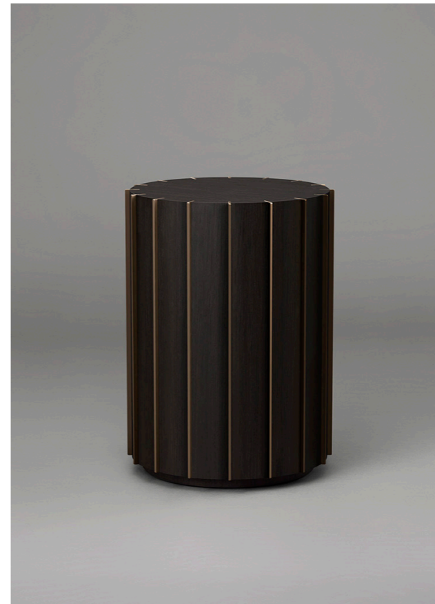
TALL SIDE TABLE

An exercise in robust minimalism balanced by fine detailing. Italian timber veneer cylinders of two sizes make for streamlined functionality; slender vertical fins spaced evenly introduce refined visual and textural detail and guide the eye to the surface, where they extend just beyond the rim.