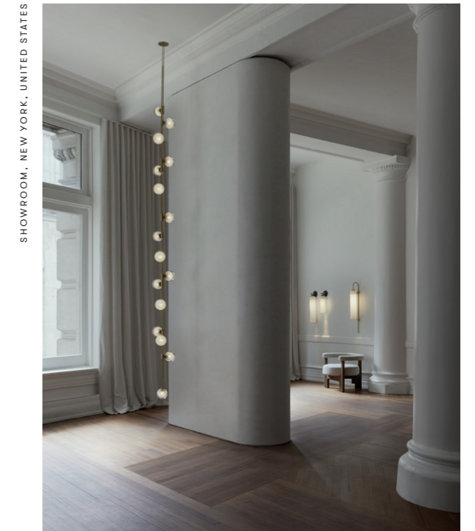
SHOWROOM, NEW YORK, UNITED STATES

Approaching design with meticulous care – bearing functionality and an enduring aesthetic equally in mind, and intent on dissolving the boundaries between design, art and architecture. Our collection is founded in a commitment to artisanal workmanship; working closely with master artisans around the world, and nurture a profound regard for their skills. Each of our pieces embodies their expertise, displaying the inherently appealing nuances of natural materials. Artico Home sets the tone with artisanal excellence and enduring materiality including bronze, Italian veneers, Italian leathers, and hand dyed straw marquetry.