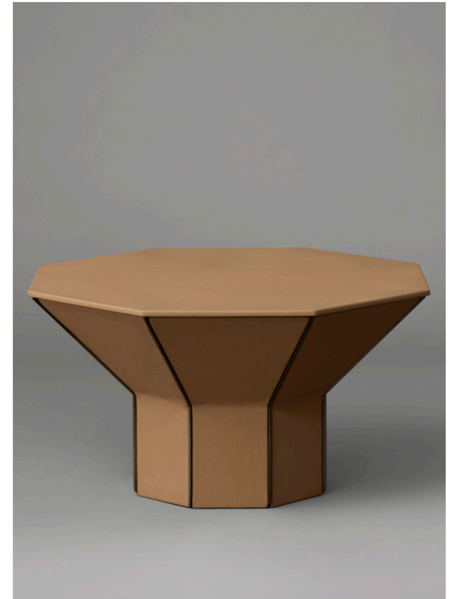
SHORT SIDE TABLE