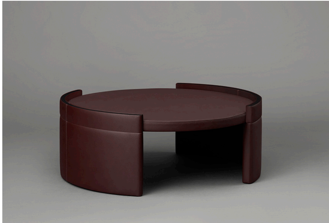
COFFEE TABLE WITH LEATHER TOP