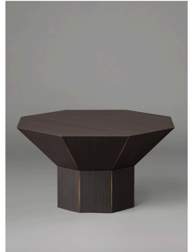
VENEER Dark Wenge BRONZE FINS