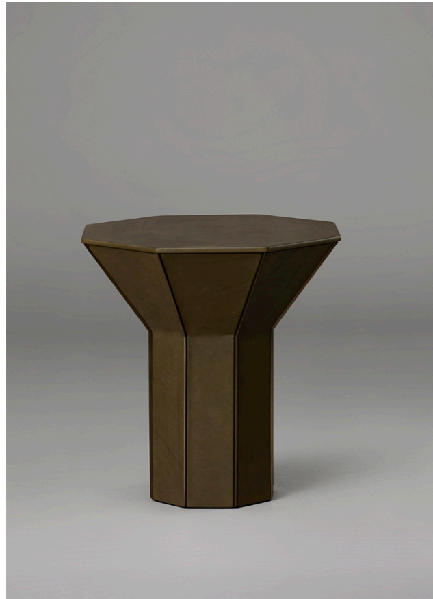
TALL SIDE TABLE