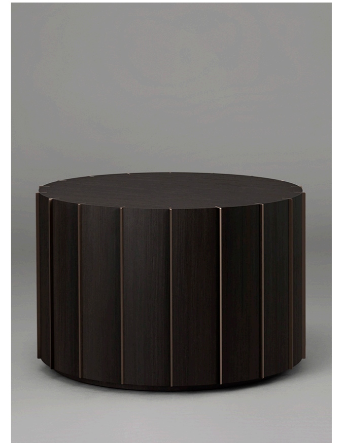
SHORT SIDE TABLE