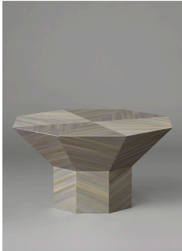
HAND DYED STRAW MARQUETRY AVAILABLE COLOURS Storm (pictured) Fog