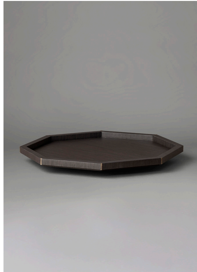
VENEER Dark Wenge BRONZE FINS