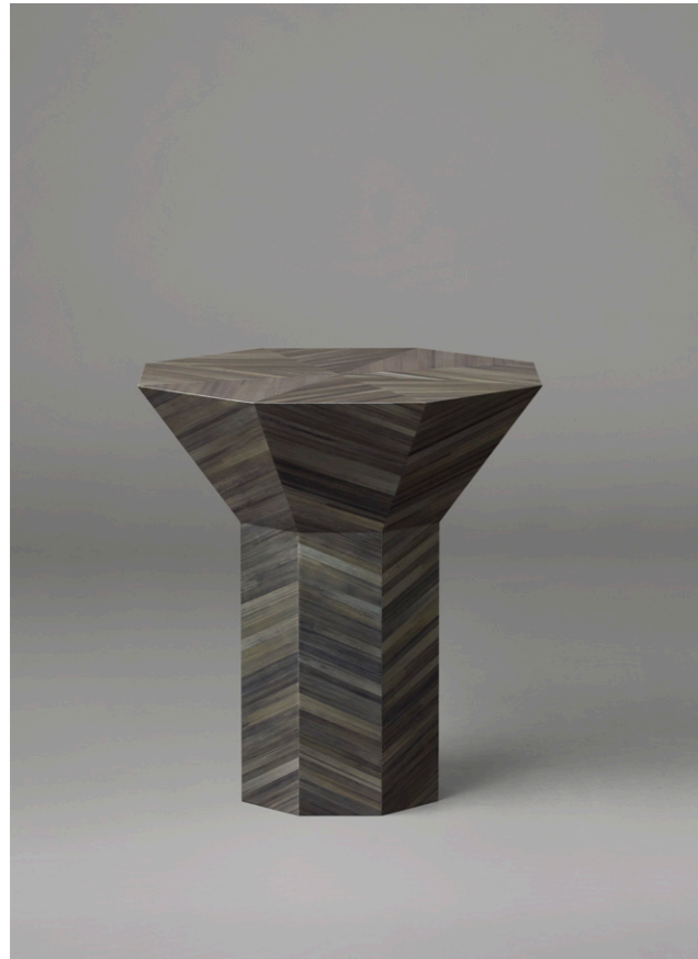
HAND DYED STRAW MARQUETRY AVAILABLE COLOURS Storm (pictured) Fog