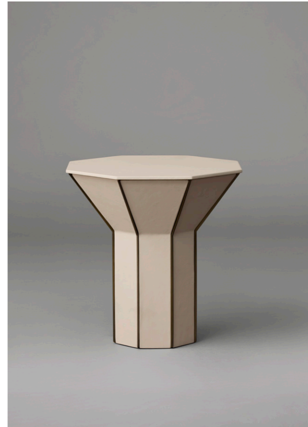
TALL SIDE TABLE