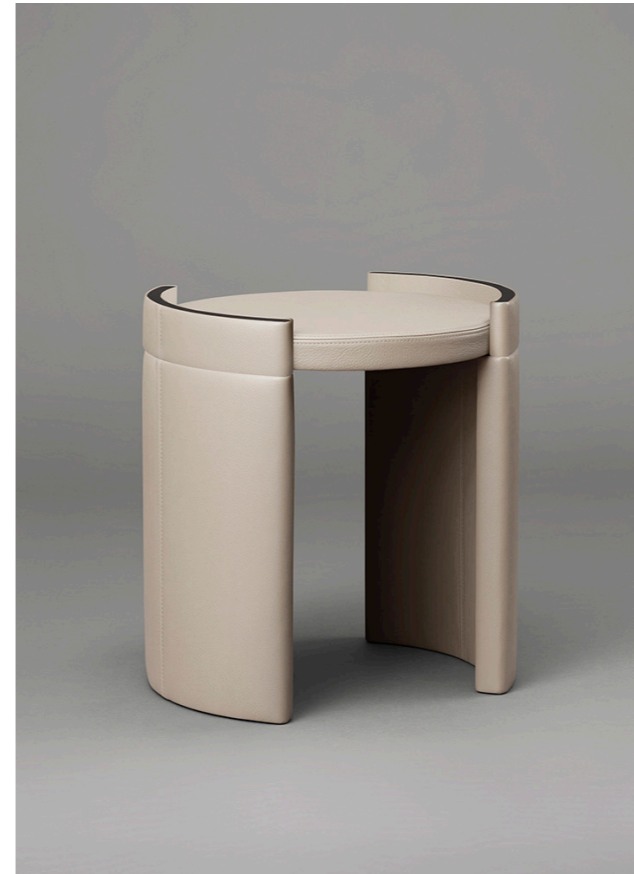
SIDE TABLE WITH VENEER CUFFS & SHELF