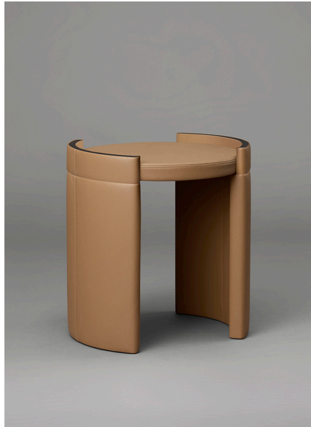
SIDE TABLE WITH LEATHER TOP & VENEER CUFFS