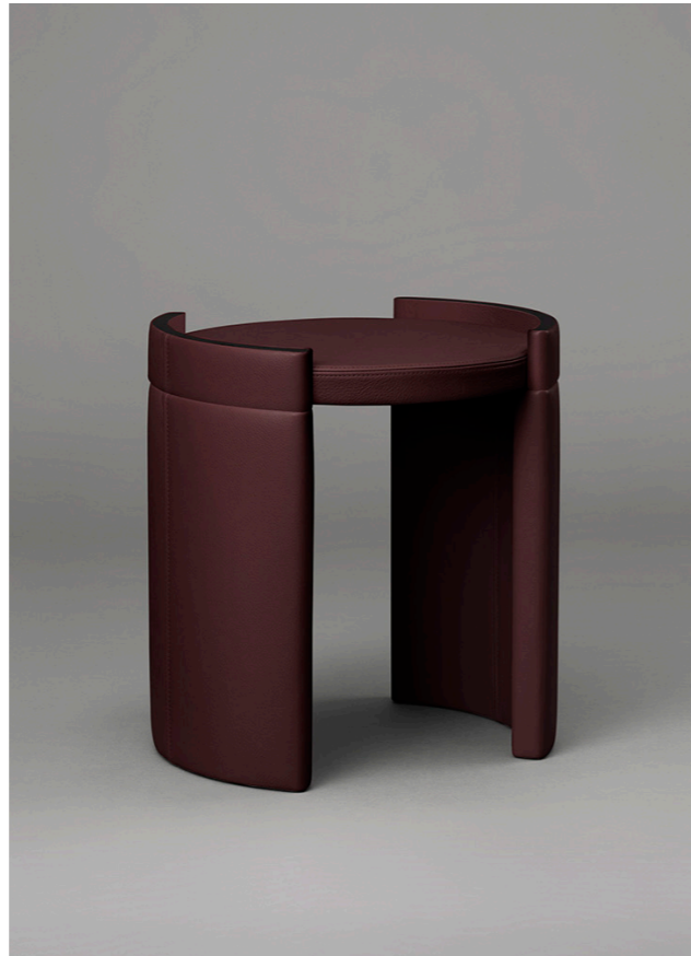
SIDE TABLE WITH LEATHER TOP & VENEER CUFFS