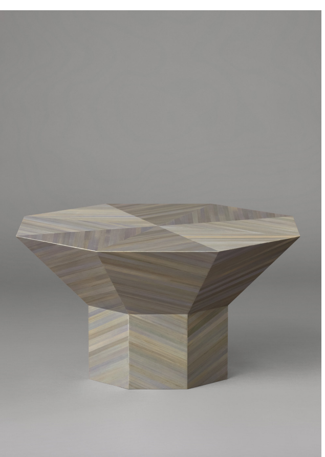
HAND DYED STRAW MARQUETRY AVAILABLE COLOURS Storm (pictured) Fog