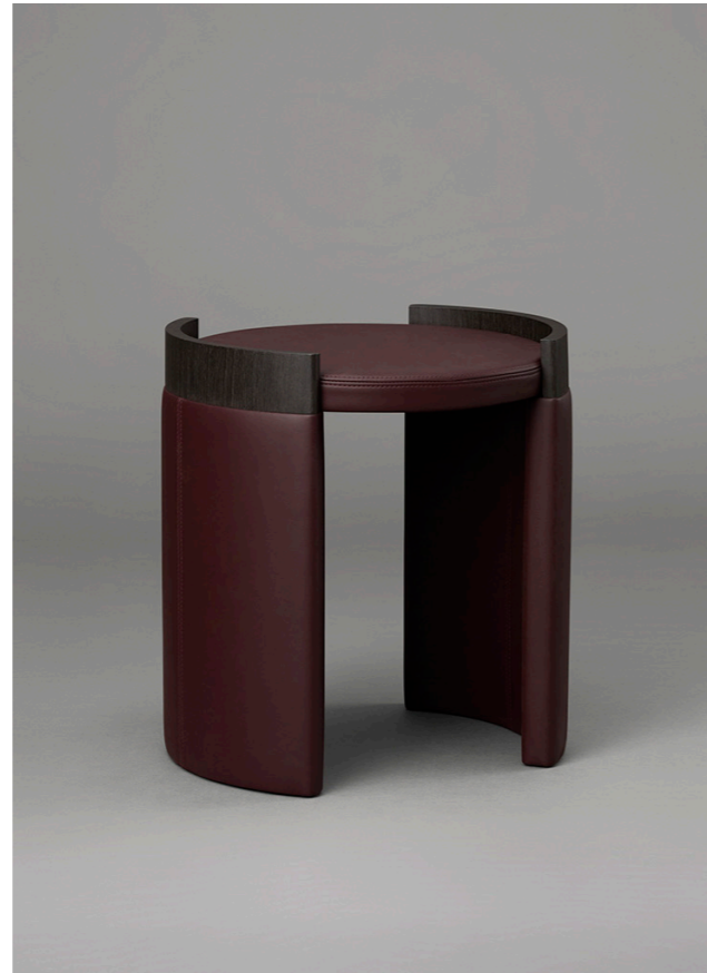
SIDE TABLE WITH LEATHER TOP & VENEER CUFFS