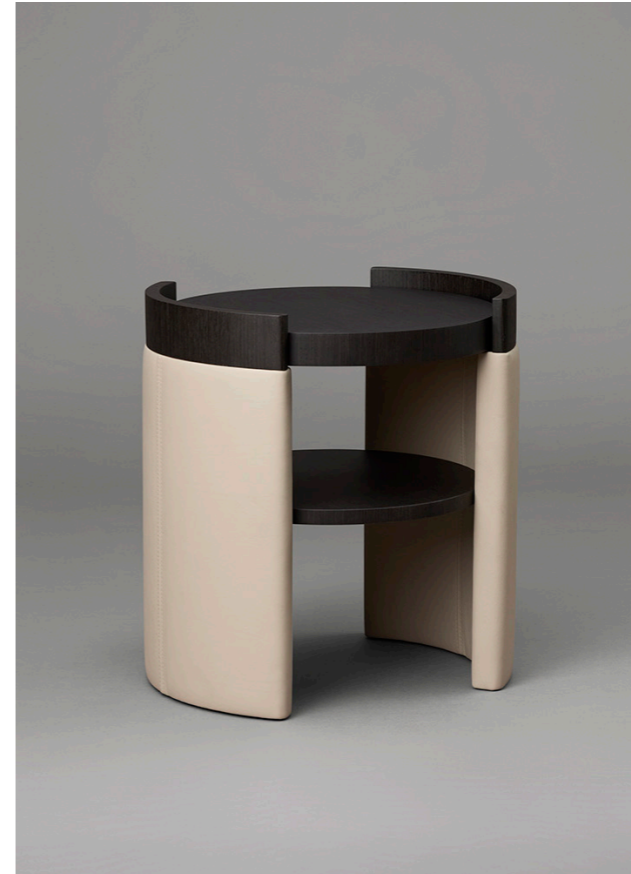
SIDE TABLE WITH VENEER CUFFS & SHELF