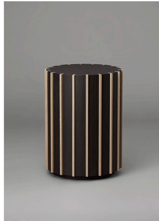
TALL SIDE TABLE

An exercise in robust minimalism balanced by fine detailing. Italian timber veneer cylinders of two sizes make for streamlined functionality; slender vertical fins spaced evenly introduce refined visual and textural detail and guide the eye to the surface, where they extend just beyond the rim. The colour palette is one of simple, well-judged contrasts between light and dark – dramatically, where the fins are set against Dark Veneer; and gently, where they span Pale Veneer.