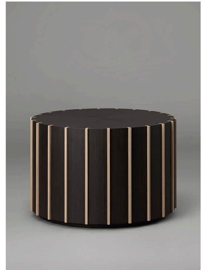
SHORT SIDE TABLE