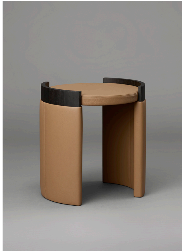
SIDE TABLE WITH LEATHER TOP & VENEER CUFFS